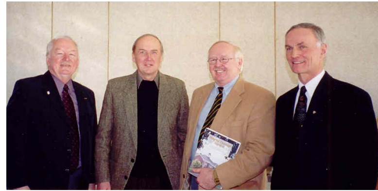
Klinck Lecture at Nova Scotia Agricultural College, February 14, 2003

Each member organization is eligible to apply for funds to a maximum of $500, to cover some of the cost of providing the lecture. These eligible costs can include speaker fees, or other related costs like audiovisual, room rental, travel expenses etc. A maximum of 3 grants will be available each year based on application date. Each member organization may apply for only one Klinck Lecture per year. Guidelines for application are available on the website or from the AICF office.