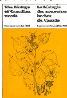
Volume 4 Contributions 84-102