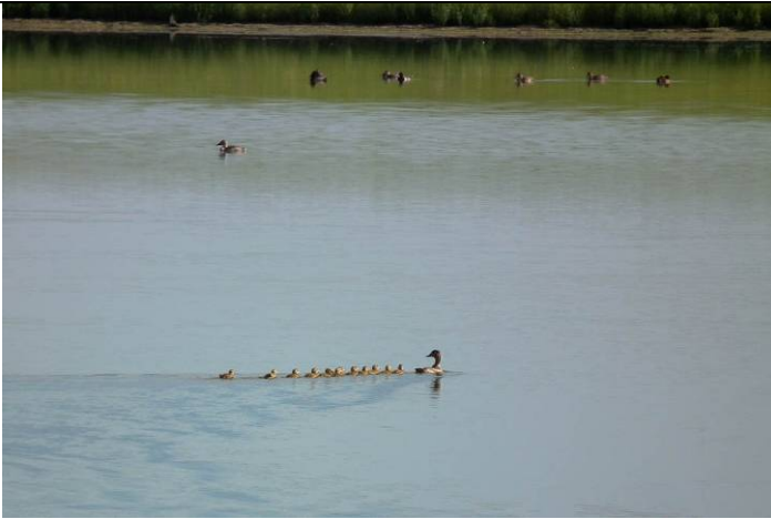
Female duck with ducklings on Manitoba pond in July.

The Gender Equality Mainstreaming (GEM) Working Group of the Agricultural Institute of Canada (AIC) gathers information and articles on an ongoing basis on gender equality mainstreaming within agriculture, scientific research, rural development, climate change and organizational development. Information is shared with members, partners, scientific societies and member organizations. The views and opinions presented are not necessarily representative of AIC.