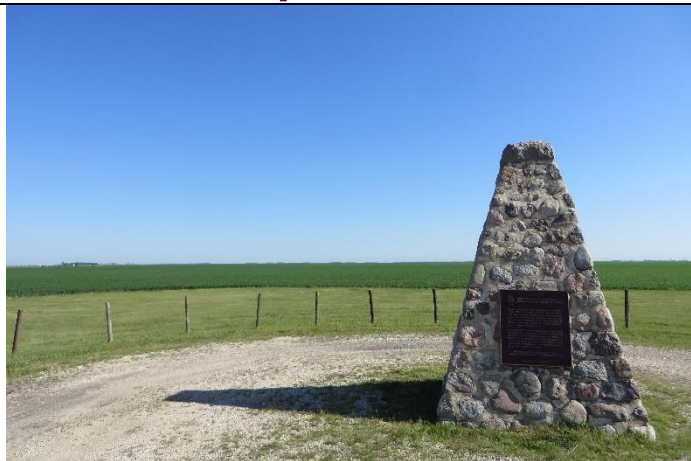
A cairn dedicated to the First (also Principal or Prime) Meridian at 97°27'28.41" west, just west of Winnipeg, Manitoba, Canada. Grain seedlings in field in background. https://en.wikipedia.org/wiki/Dominion_Land_Survey.

The Gender Equality Mainstreaming (GEM) Digest provides a compilation of information and articles gathered on an ongoing basis on gender equality mainstreaming within agriculture, scientific research, rural development, climate change, organizational development and international development. Information is shared with members, colleagues, scientific societies and diverse organizations.