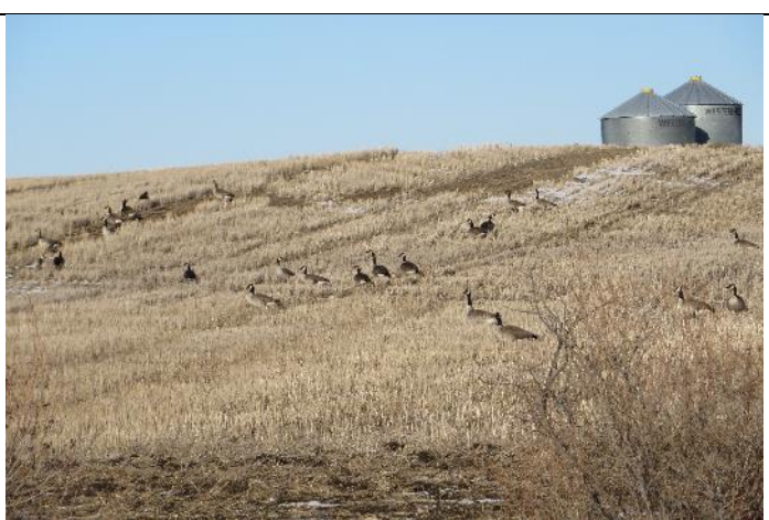
Wild Canada geese returning in spring to farm field from southern migration.